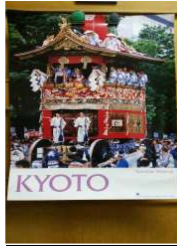
Kyoto (Summer Festival)