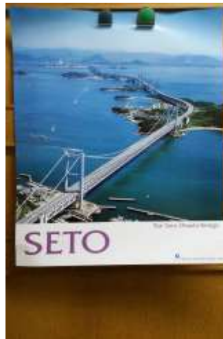
The Seto Ohashi Bridge