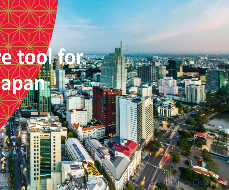
Ho Chi Minh City